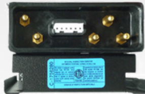
PM-2L-SV Rear View