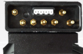
PM-2L-C21 Rear View