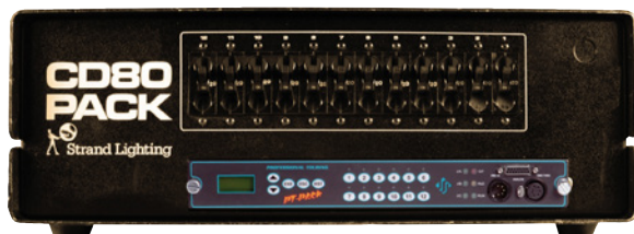
Strand CD80® Pack with JSI PT-PACK digital DMX 512 controller

DMX input and state-of-the-art high speed processing make upgrading these ruggedly built “work-horse” dimmer packs fast, simple, and inexpensive!